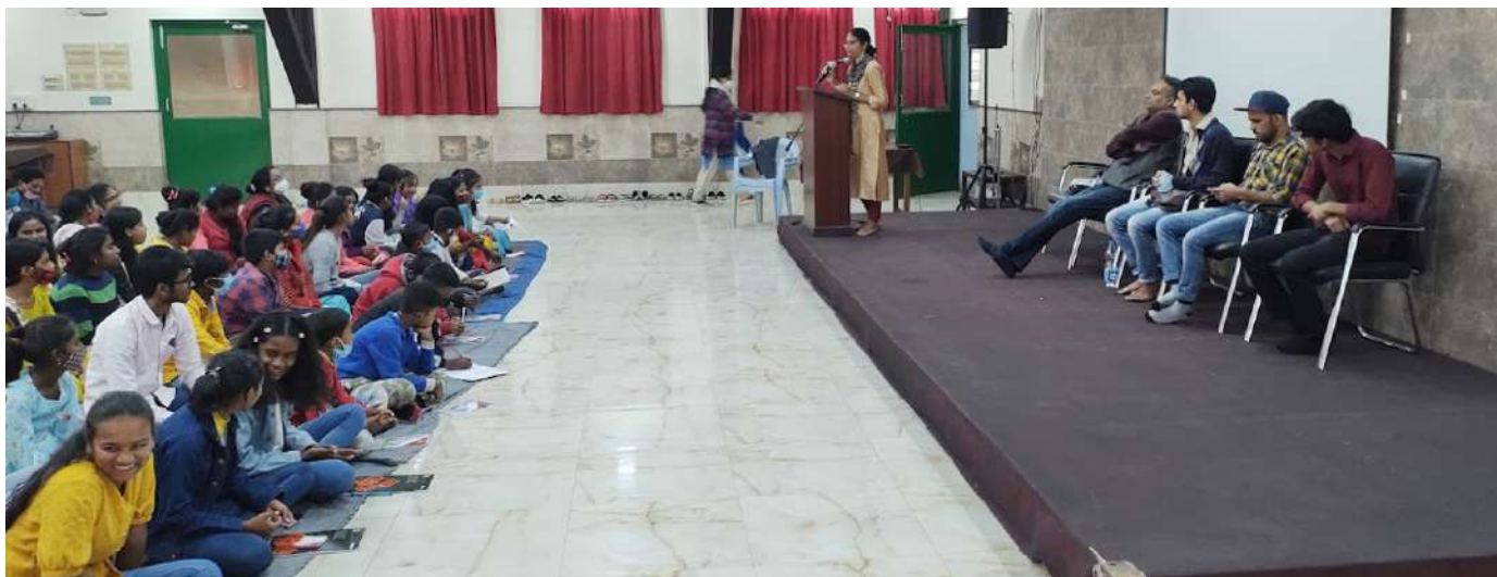
Phase 2: 13th December 2021- 17th December 2021

35 Child Leaders performed in front of different stakeholders – government, INGOs, NGOs Academicians, media, and individuals' welcome song and three plays. Three plays were prepared based on the issues identified in phase-1 and phase-2.