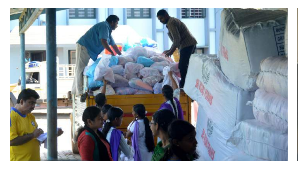
The table below provides details of the response under the Emergency Appeal: